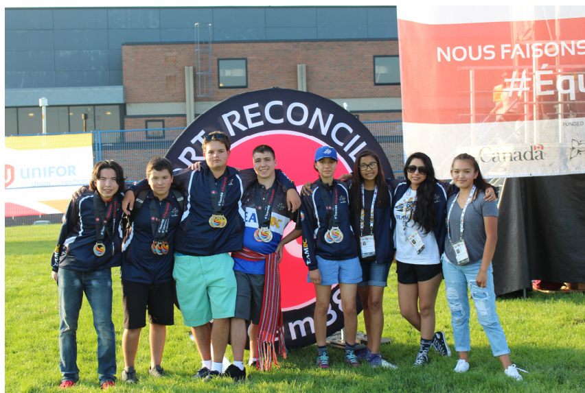
BC Shooters attending the 2017 North American Indigenous Games

Official Newsletter of the British Columbia Target Sports Association